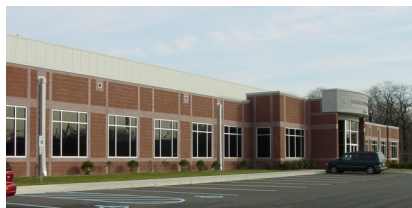
Newly developed Kohler Distributing; Hawthorne

The activities of the Passaic County Brownfield Assessment Program are implemented by the Passaic County