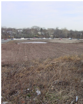
Route 20 between 4th and 5th Avenues; Paterson

Former or current industrial or commercial sites that are currently vacant or underutilized, on which there has been, or there is suspected to have been, a discharge of contamination.