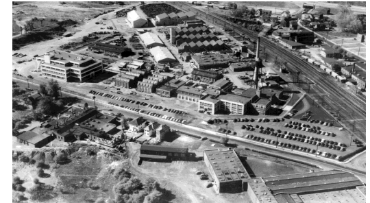
Givaudan Fragrance Plant, a 50-acre parcel, circa 1920; Clifton, NJ