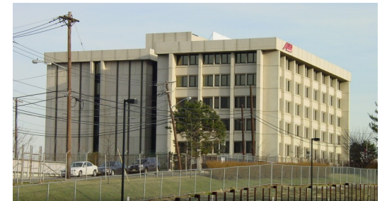
Givaudan site reinvented by the Morris Companies to include three warehouse/distribution buildings totaling 774,000 square feet and the Mountain Development Company (Mountain Technology Center), a modern, high-tech office building of 211,000 square feet, depicted above.