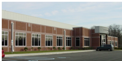
Newly developed Kohler Distributing; Hawthorne

The activities of the Passaic County Brownfield Assessment Program are implemented by the Passaic County